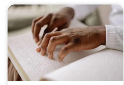
We value quality